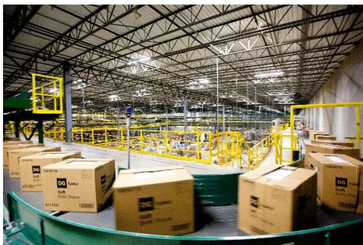
DOLLAR GENERAL DISTRIBUTION FACILITY IN MARION, IN

Dunham's Athleisure Corporation invested over $20 million to expand its Marion, Indiana, distribution center to 732,000 square feet and an additional $12 million in new equipment, representing one of the largest economic development projects in Indiana for 2014.